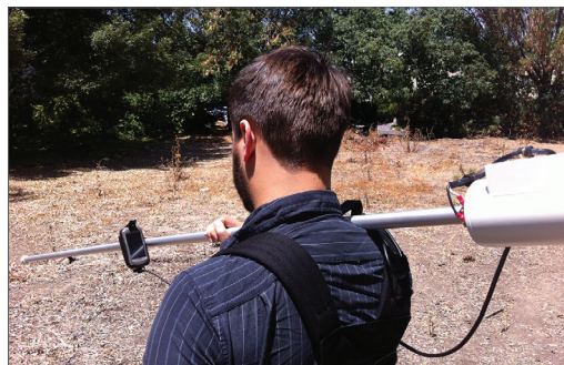
G-857 and Optional Garmin® GPS

The G-857 provides a reliable, low-cost solution for a variety of magnetic search and mapping applications. Single keystroke operation means the G-857 can be operated by non-technical field personnel and used in teaching environments. The G-857 uses the well-established proton precession method, allowing accurate measurements to be made with virtually no dependence upon variables such as sensor orientation, temperature or location. The unit provides a repeatable absolute total field magnetic reading, traceable to the National Institute of Standards and Technology.